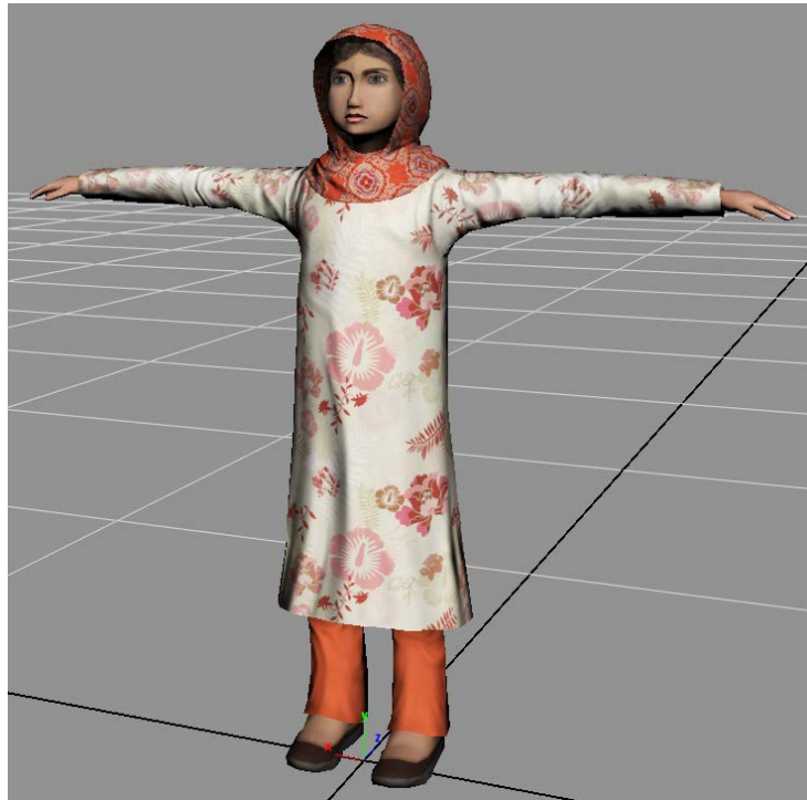
Afghan Youth Female 3