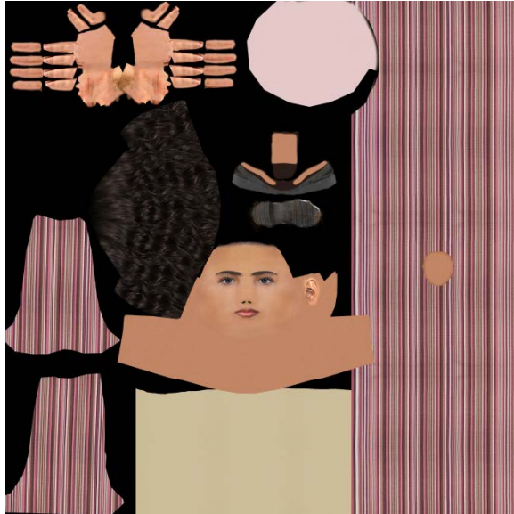
Figure 5 Afghan Youth Female 1 Texture Map