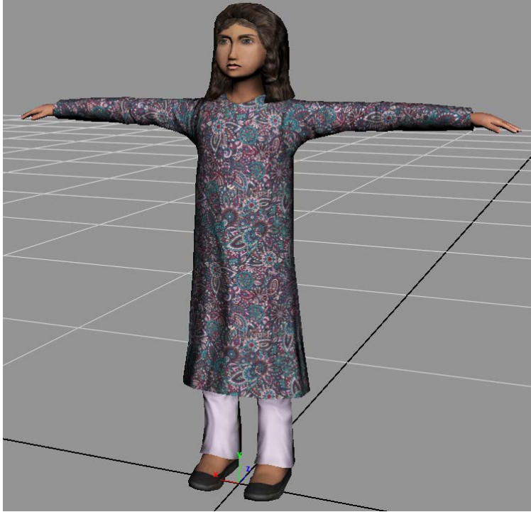
Afghan Youth Female 2