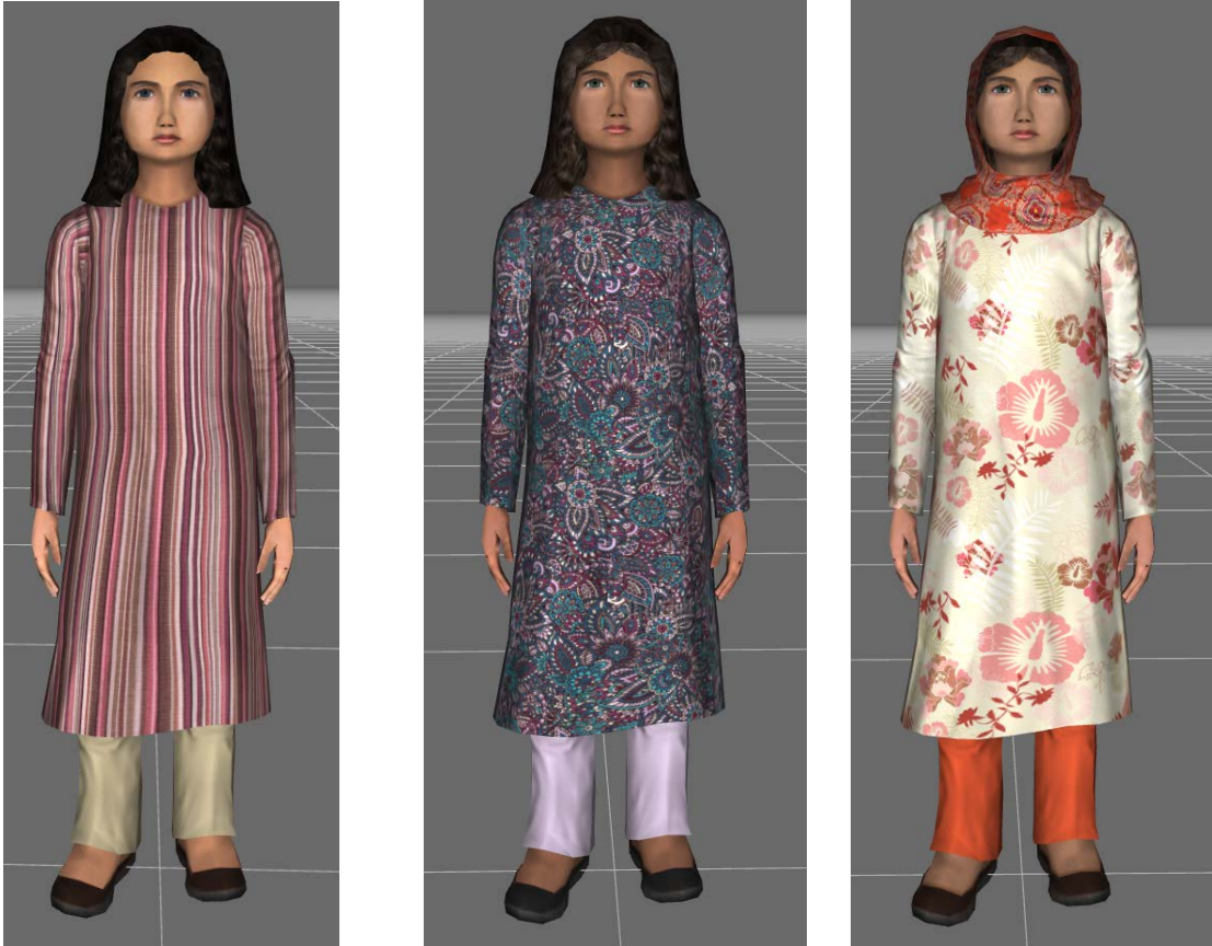
Afghan Youth Female 1