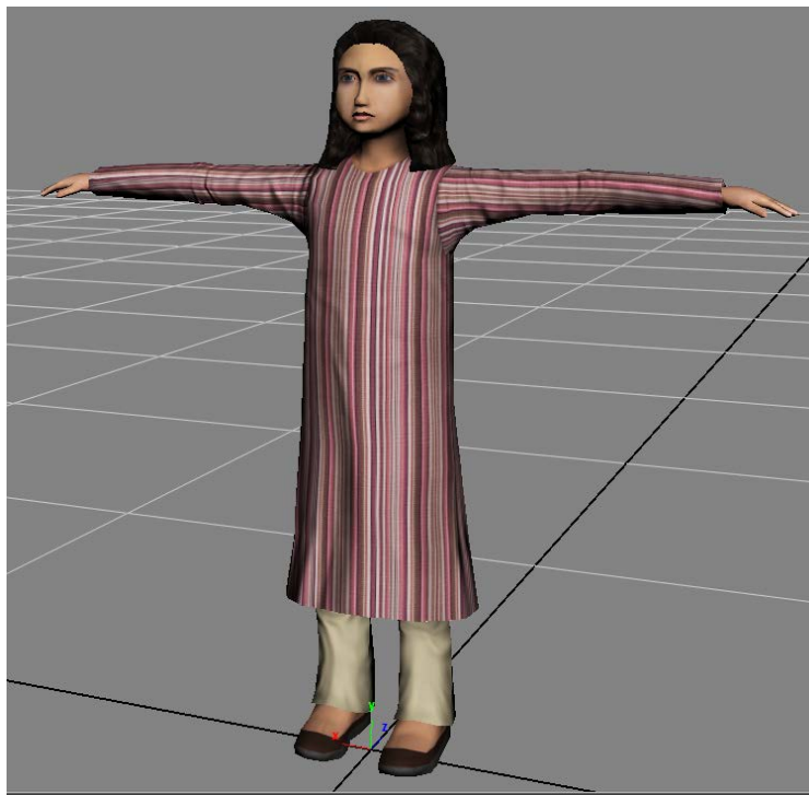
Afghan Youth Female 1