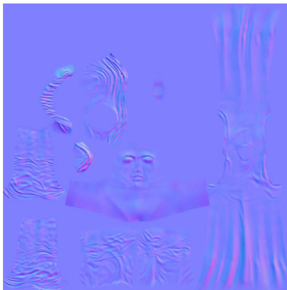
Figure 6 Afghan Youth Female 1 Normal Map