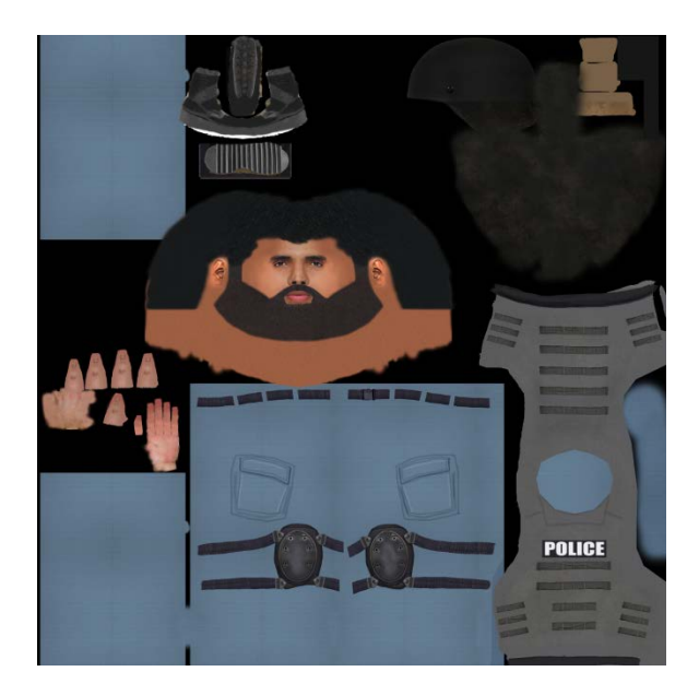
Figure 3 Afghan Police Officer Texture Map