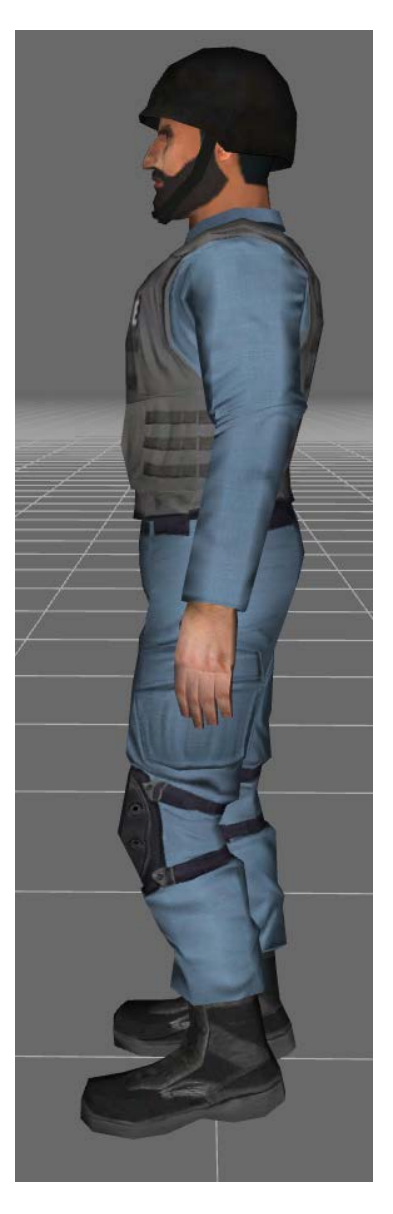
Figure 1 Afghan Police Officer Character Model