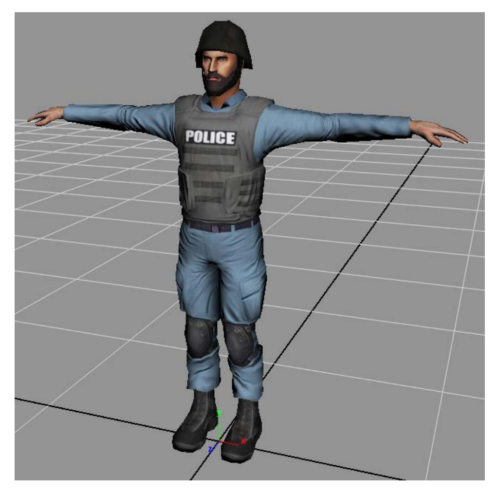
Figure 2 Afghan Police Officer Origin on Cartesian X, Y, Z Coordinate System