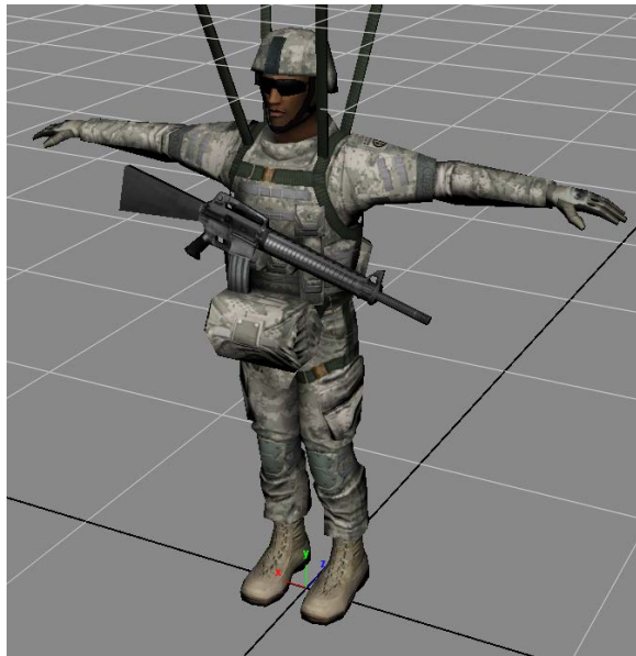
Figure 2 Parachute Origin on Cartesian X, Y, Z Coordinate System