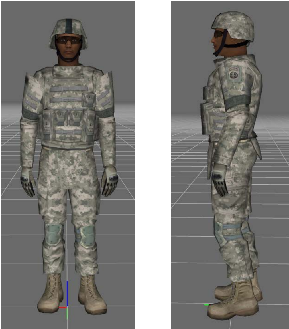
Figure 1 U.S. Paratrooper Character Model