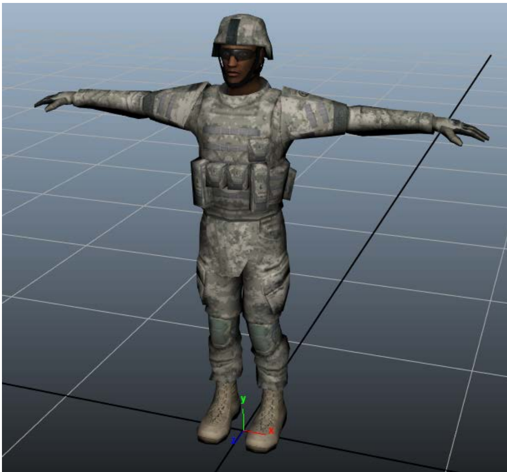
Figure 2 U.S. Paratrooper Origin on Cartesian X, Y, Z Coordinate System