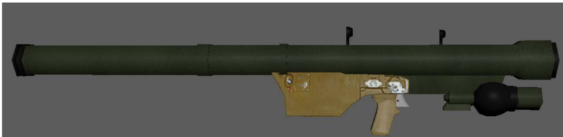
Figure 1 SA14 Gremlin Weapon Model