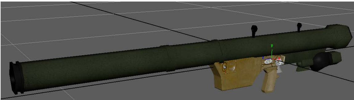
Figure 2 SA14 Gremlin Origin on Cartesian X, Y, Z Coordinate System